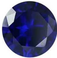
34# sapphire blue